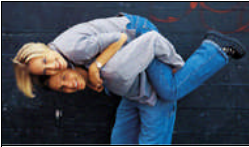
"Piggybacking" or "Coat-tailing" is a method of quickly improving one's credit score.

Since credit scores are derived from computer programs that analyze long-term payment histories, undoing a poor score can take quite awhile; a number of good years may be required to negate one stretch of trouble.